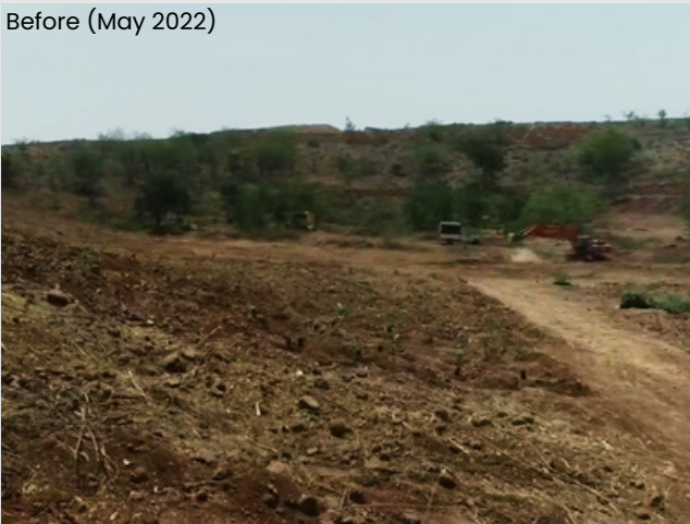
Before (May 2022)