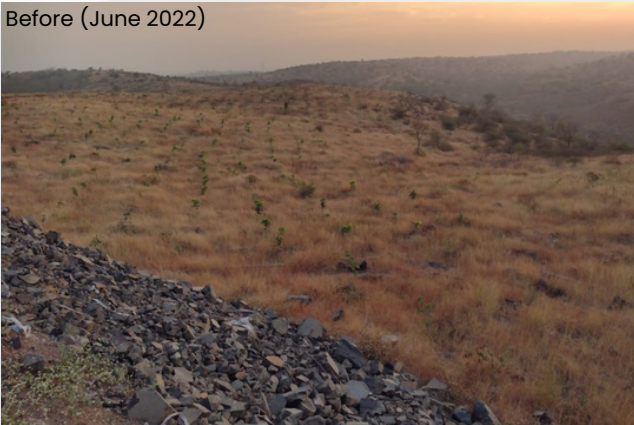
Before (June 2022)