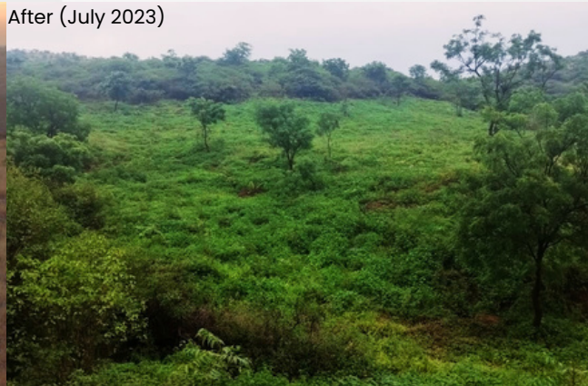
After (July 2023)