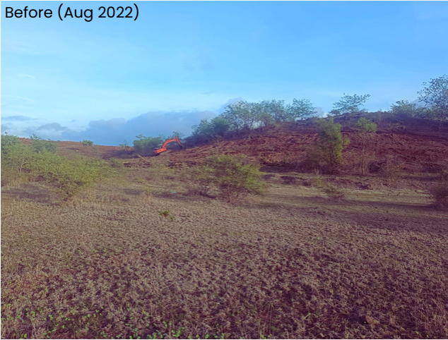
Before (Aug 2022)