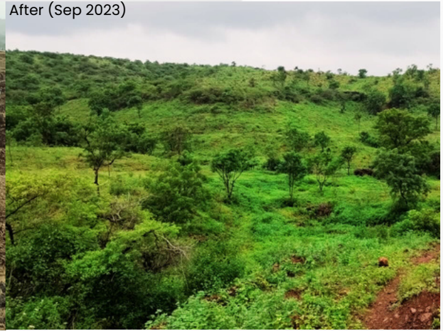
After (Sep 2023)