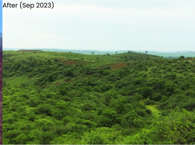
After (Sep 2023)