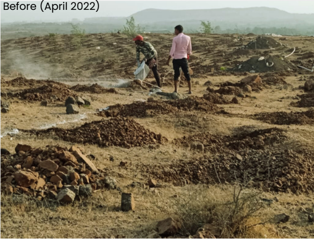
Before (April 2022)